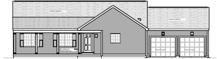
FRONT ELEVATION SCALE 1/4" = 1'-0"