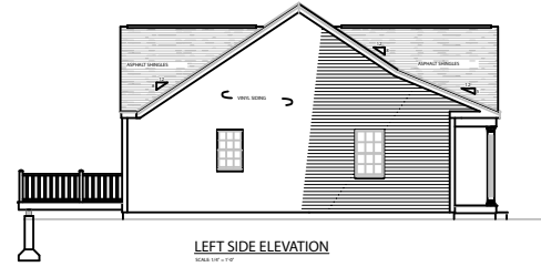
LEFT SIDE ELEVATION SCALE 1/4" = 1'-0"