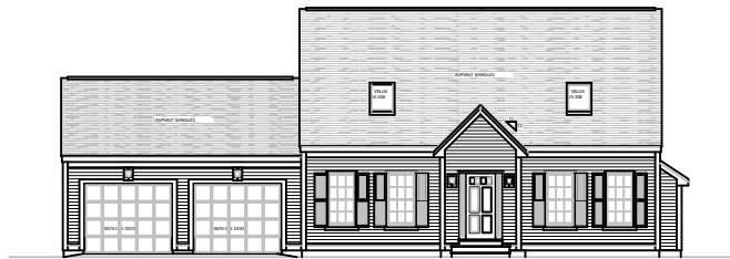
FRONT ELEVATION SCALE 1/4" = 1'-0"