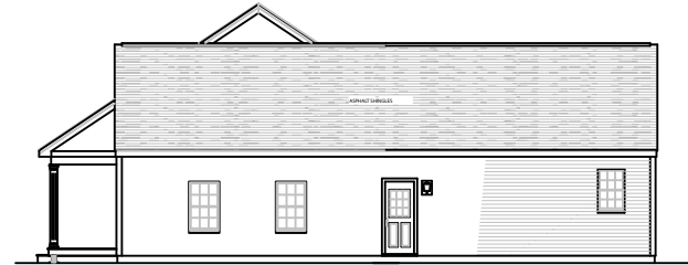
RIGHT SIDE ELEVATION SCALE 1/4" = 1'-0"