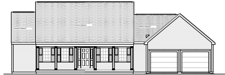
FRONT ELEVATION SCALE 1/4" = 1'-0"